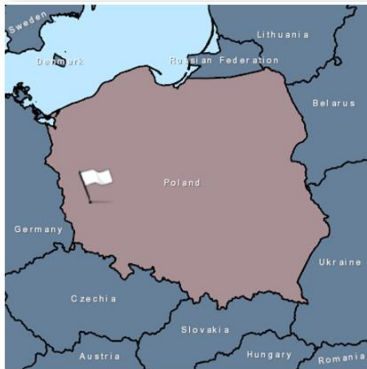
Figure 1 below: Location of African swine fever outbreak in Poland on 20 th March 2020

Poland continues to report cases of ASF in wild boar in affected areas in both eastern and western parts of the country. The nearest confirmed case of ASF in western Poland reportedly occurred just 13km from the German border.